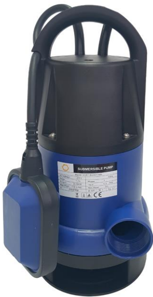
VORT BUDDY 400