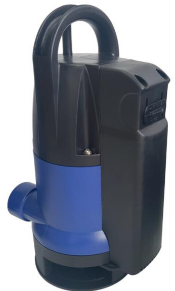
SUMP BUDDY AUTO REAR