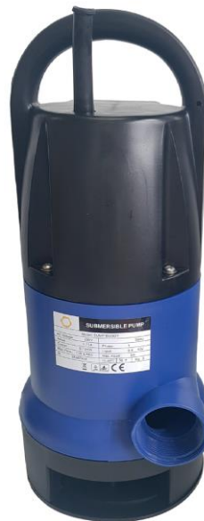
SUMP BUDDY AUTO