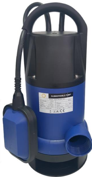
VORT BUDDY 900